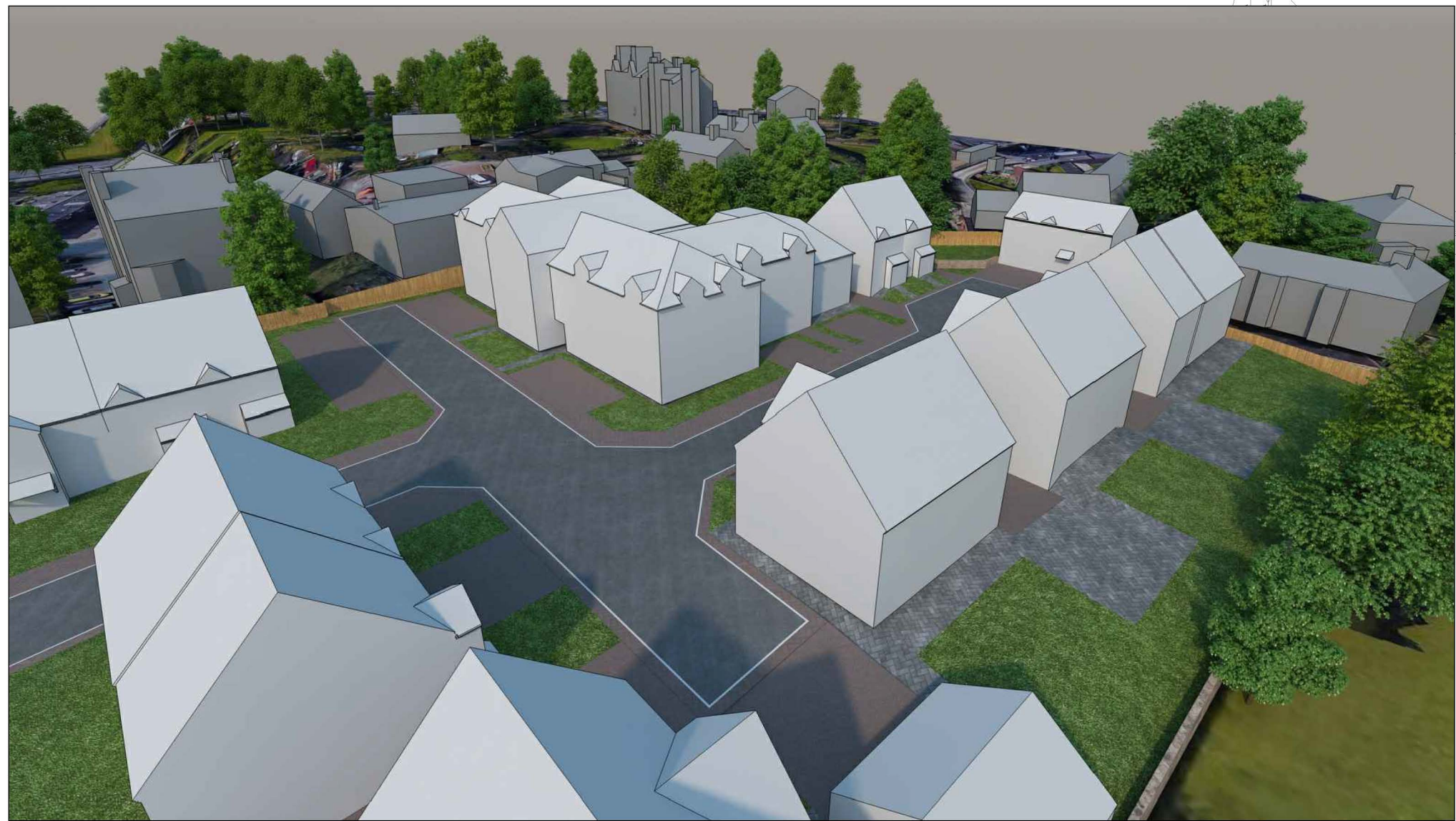
VISUAL C VISUALS LOOKING EAST