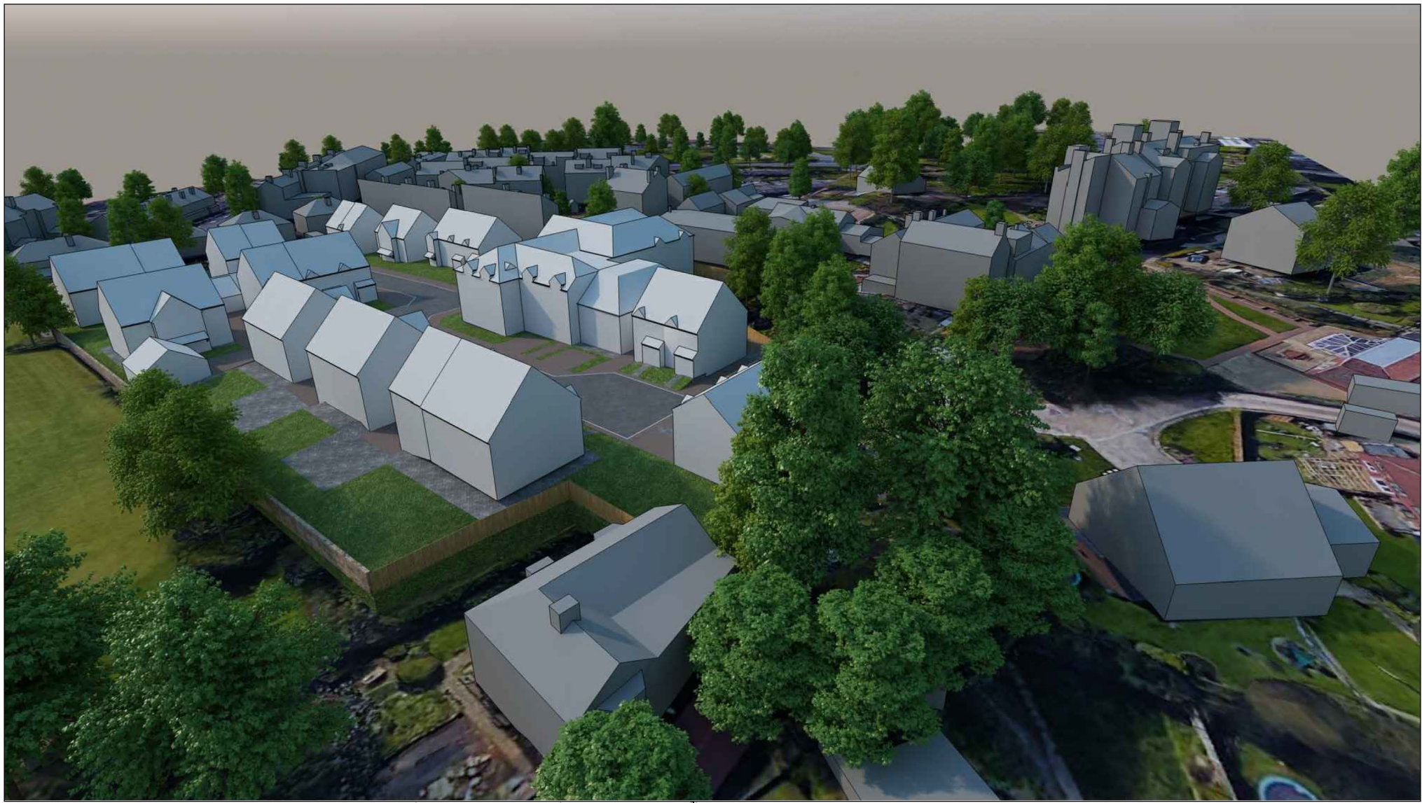
VISUAL B VISUALS LOOKING SOUTH