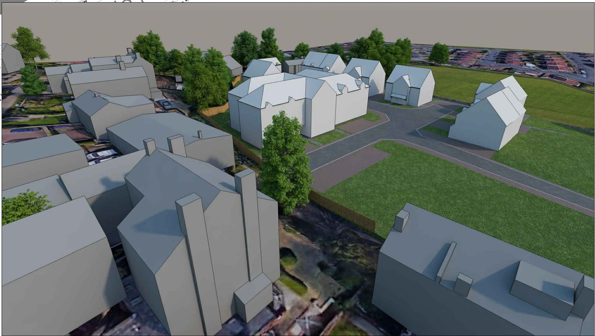
VISUAL D VISUALS LOOKING NORTH