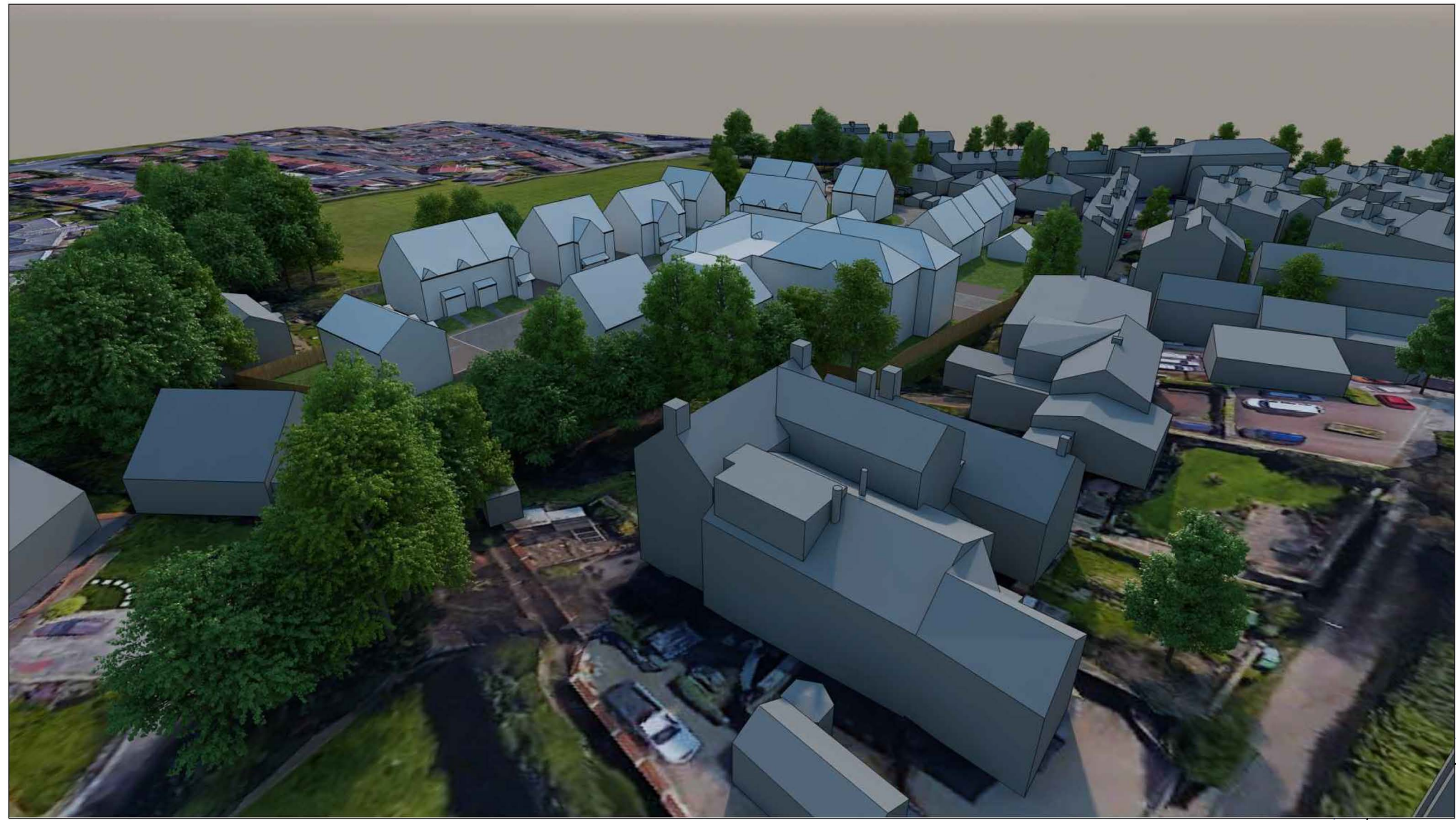
VISUAL A VISUALS LOOKING SOUTH-EAST